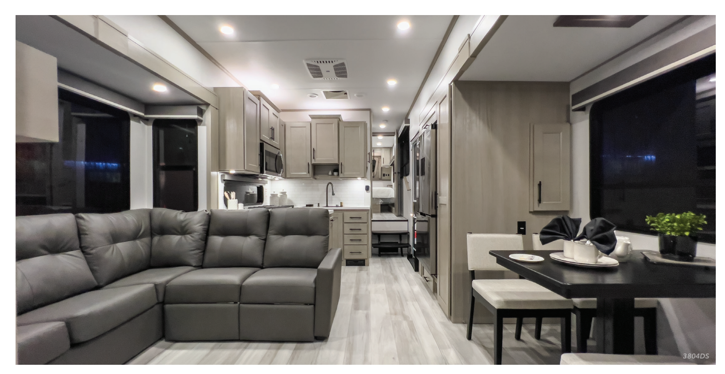
Because of our commitment to continuous product improvement, Grand Design Recreational Vehicles reserves the right to change components, standards, options, specifications, and materials without notice and at any time. Photos may show optional equipment which may not be included in the standard purchase price of the featured unit. Be sure to review current product details with your local dealer before purchasing.