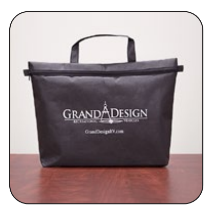
Owner Information Package